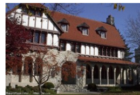
Photo exhibit at the Troy Hayner Center. Lunch at Night Sky. Meet at the Senior Center at 11:00a to carpool.

Friday, August 29th: Dinner at Hickory River Restaurant. Meet at 5:00p at the Senior Center to carpool.